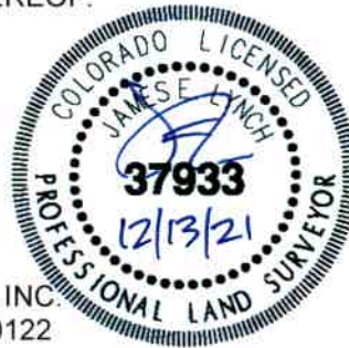
ILLUSTRATION ATTACHED AND MADE A PART HEREOF.